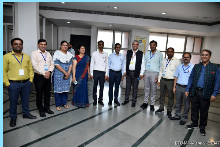
Micro2024: Some organizers, at Delhi Technological University.