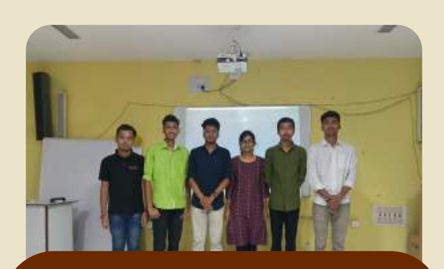
TEAM NAME - ASPIRE TEAM ID - 08 PSID - SIH1607