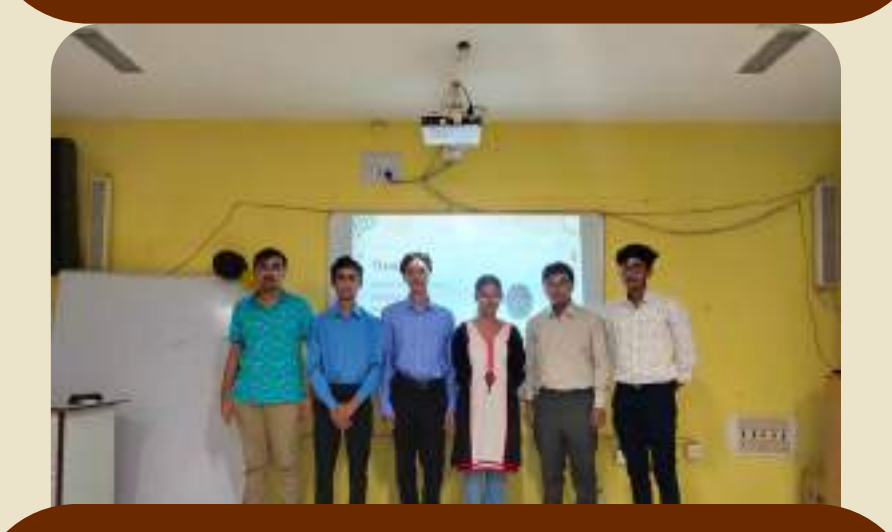
TEAM NAME - RUDDRAS TEAM ID - 05 PSID - SIH1591