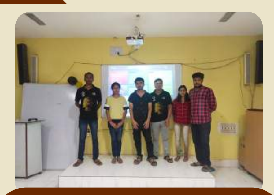
TEAM NAME - SIXTH SENSE TEAM ID - 02 PSID - SIH1554