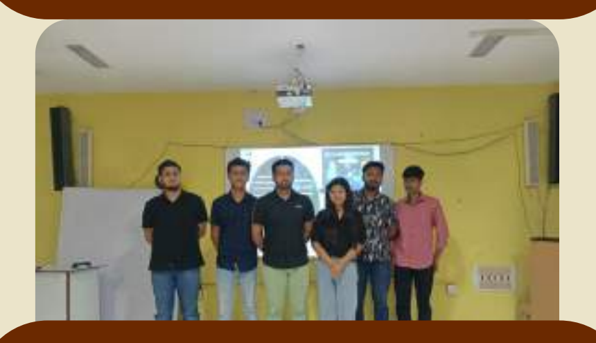
TEAM NAME - THE COSMIC EXPLORERS TEAM ID - 07 PSID - SIH1602