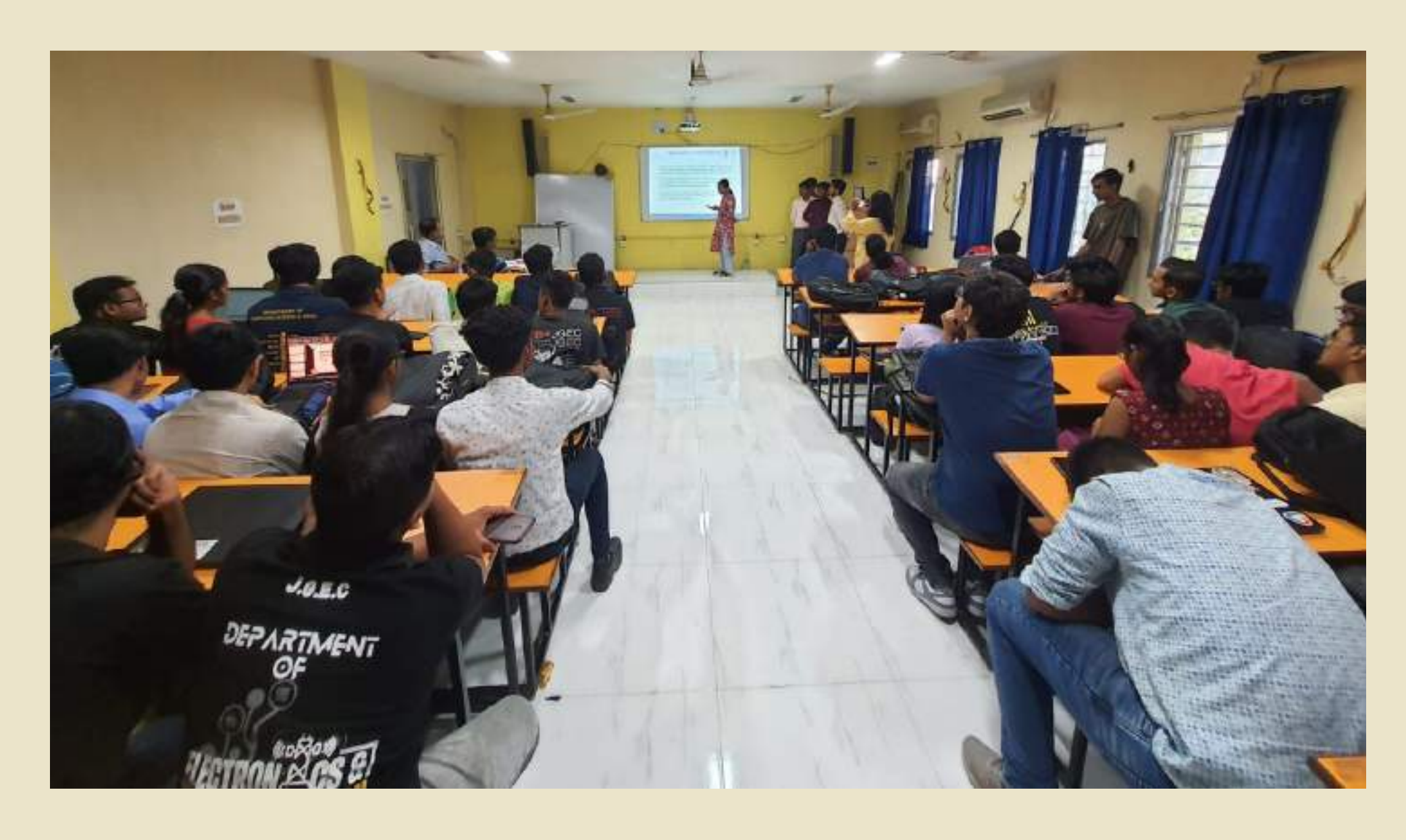
INTERNAL HACKATHON FOR SIH 2024