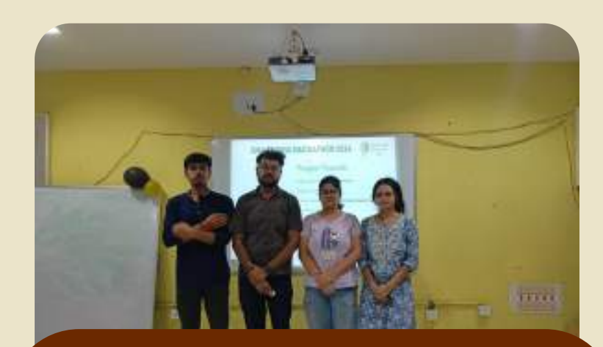
TEAM NAME - BINARY MINDS TEAM ID - 11 PSID - SIH1648